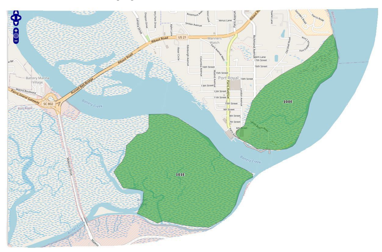
Figure 12. General Map of lands

Project location is South, Southeast, and Southwest of the City of Port Royal, South Carolina along Battery Creek. Tract 100E consists of 227 acres dredge deposit material easement. Tract 101E consists of 428 acres of dredge deposit material easement. The Project is open to vessel traffic and to the public for various recreation actives including fishing. The Corps conducts annual monitoring surveys and is responsible for maintenance dredging if funds are provided. Note: Tract A in REMIS was disposed by letter from USMC to USACE dated 25 April 2019 and is therefore not shown on map figure 2.