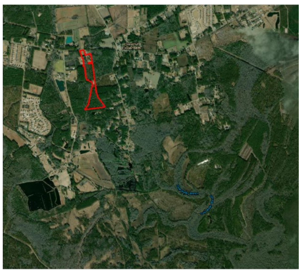
Figure 2: Aerial Imagery (ESRI Basemap) showing Cold Water Branch in relation to site. Additionally depicted are the myriad of physical barriers separating wetlands 2&3 and any (a)(1-3) waters.