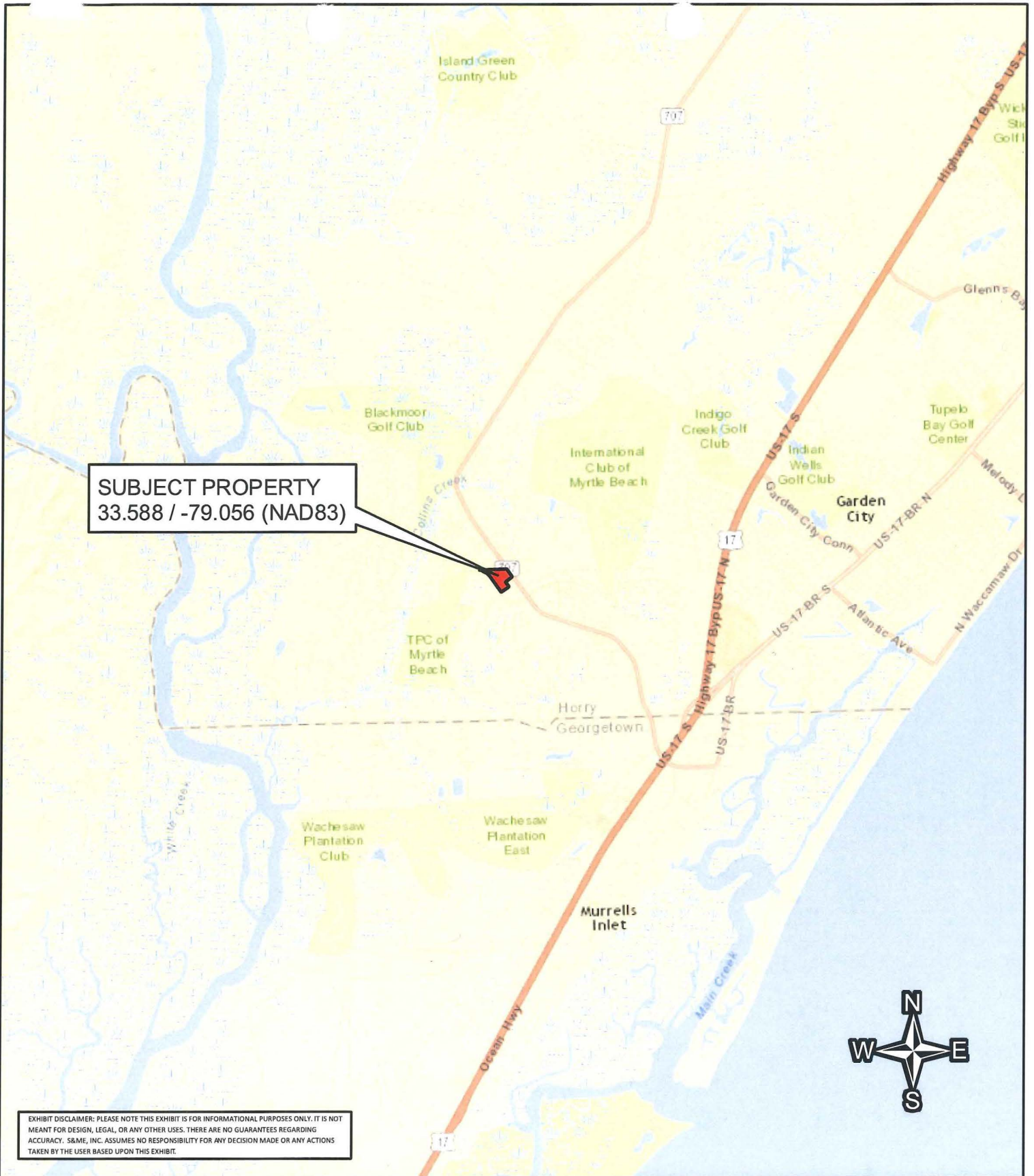
EXHIBIT DISCLAIMER: PLEASE NOTE THIS EXHIBIT IS FOR INFORMATIONAL PURPOSES ONLY. IT IS NOT MEANT FOR DESIGN, LEGAL, OR ANY OTHER USES. THERE ARE NO GUARANTEES REGARDING ACCURACY. S&ME, INC. ASSUMES NO RESPONSIBILITY FOR ANY DECISION MADE OR ANY ACTIONS TAKEN BY THE USER BASED UPON THIS EXHIBIT.