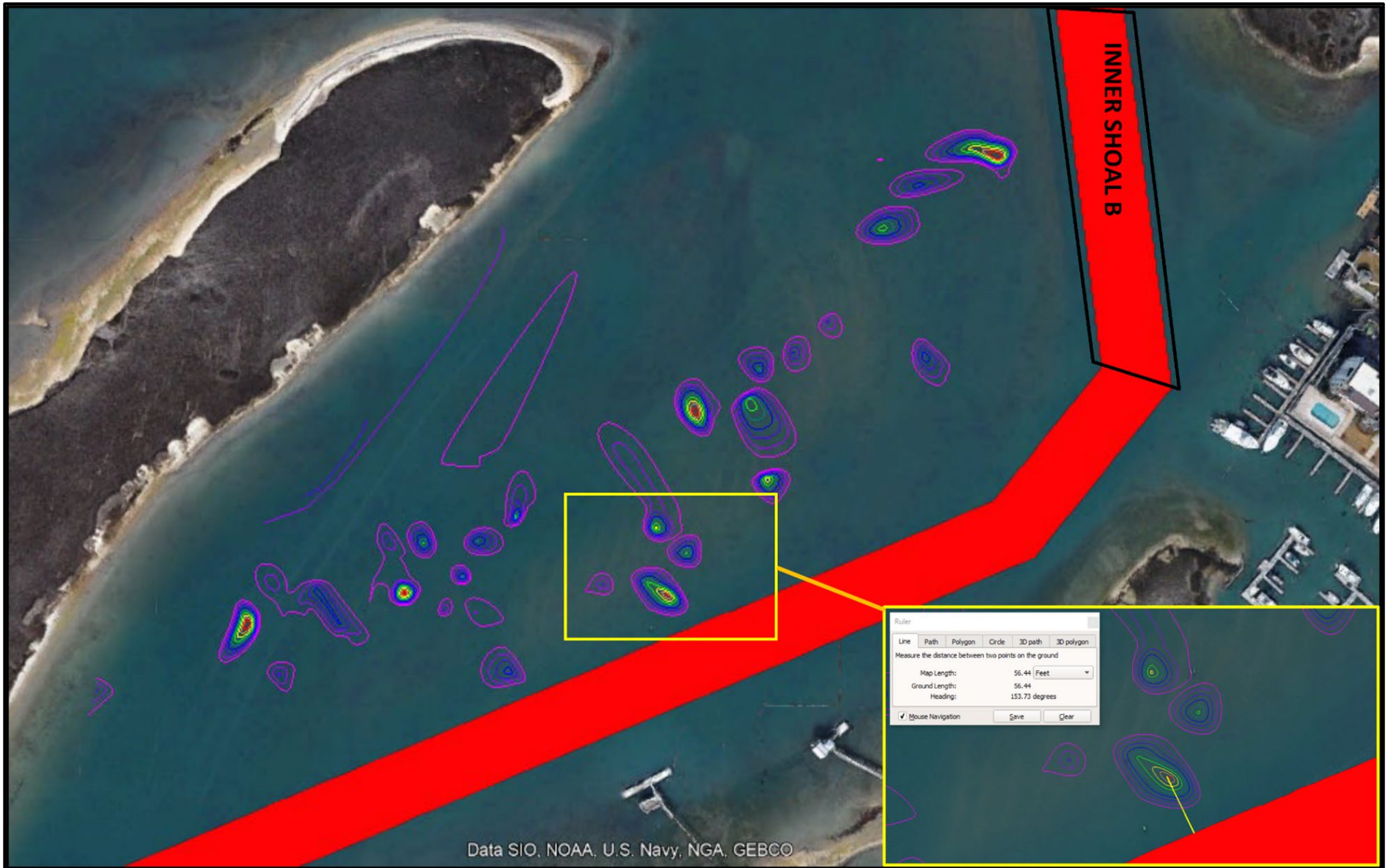
Figure 2. Anomaly Footprint and Buffer Zone