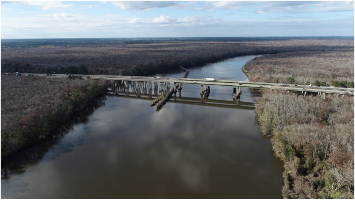
Figure 2: Upstream fender system in the project area