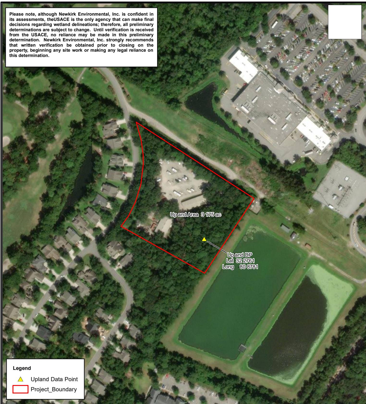
Figure 05: Findings Map

Please note, although Newkirk Environmental, Inc. is confident in its assessments, the USACE is the only agency that can make final decisions regarding wetland delineations; therefore, all preliminary determinations are subject to change. Until verification is received from the USACE, no reliance may be made in this preliminary determination. Newkirk Environmental, Inc. strongly recommends that written verification be obtained prior to closing on the property, beginning any site work or making any legal reliance on this determination.